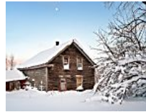
BILLS.COM Big Changes Are Coming For Homeowners In 2016