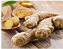
DEFINEVIRALS 10 Vegetables You Only Have To Buy Once And Regrow Forever!