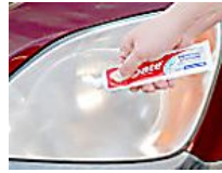
MSGOSSIP 10 Genius Tricks To Help You Save Time Cleaning This Winter...