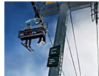
THE DENVER POST Aspen: Skier who pushed snowboarder off chairlift to be...