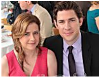
E! ONLINE John Krasinski Responds to Jenna Fischer's Comments About...