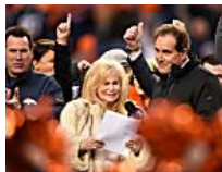
ALL THINGS BRONCOS COLORADO Broncos pay for all employees to travel to Super Bowl 50