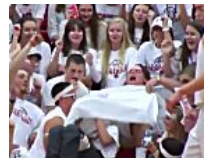
PREPPED Ohio high school students fake childbirth for free throw...