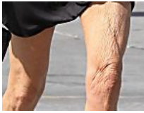
BEVERLY HILLS MD How To: Fix Crepey Skin [Watch]