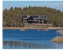
HGTV Steven Seagal's Cattle Ranch in California