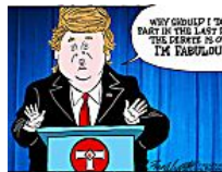
BLOGS | THE DENVER POST Donald Trump skipping Fox News debate: Cartoons of the day