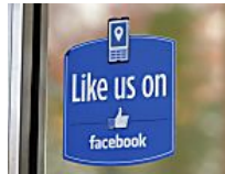
THE DENVER POST In October, Facebook will expand beyond the Like