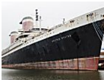
THE DENVER POST Deal struck to save historic ocean liner SS United States