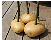
MINDBUZZ 7 Gardening Tricks That'll Turn Your Thumb Green