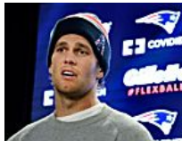
ALL THINGS BRONCOS COLORADO They Said It: Tom Brady on why it's tough to play in Denver