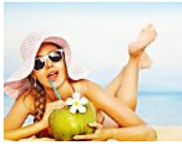
BREAKINGCOFFEE 6 Smart Ways To Use Coconut Oil