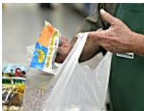
THE DENVER POST Colorado ranks 46th in nation for getting food stamps to...