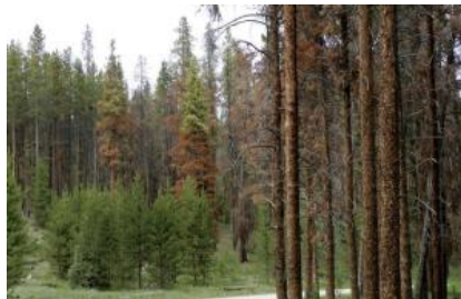
Pine trees in the White River National Forest near Frisco, Colo., glow rusty red after being killed by the mountain pinebeetle in this July 5, 2005, file photo. The pine beetle infestation that ran across Colorado, Wyoming and South Dakota has affected an area roughly the size of Massachusetts.

Much of the reason for the spruce beetle problem continues to be blown-down trees, drought